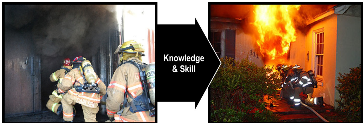
Figure 1. Training Transfer to Operational Incidents

It is reasonable to expect that firefighters and fire officers should learn to make critical decisions based on anticipated fire behavior and to work effectively in the fire environment before being called upon to do so under emergency conditions. However, as Aristotle observed; “for the things we have to learn before we can do, we learn by doing” (Aristotle, 1984, p. 1738). Training in a realistic context not only provides an opportunity to develop a practical understanding of fire dynamics and proficiency in firefighting skills, but is also a means for learners to recognize cues and conditions that are critical to effective decision-making.