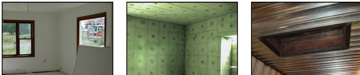
Figure 2. Variations in Structural Characteristics Influence Fire Behavior

Note: From left to right, these photos illustrate an acquired structure with gypsum board compartment linings, a purpose built masonry burn building with high temperature ceramic lining, and steel container based prop with corrugated sheet steel lining.