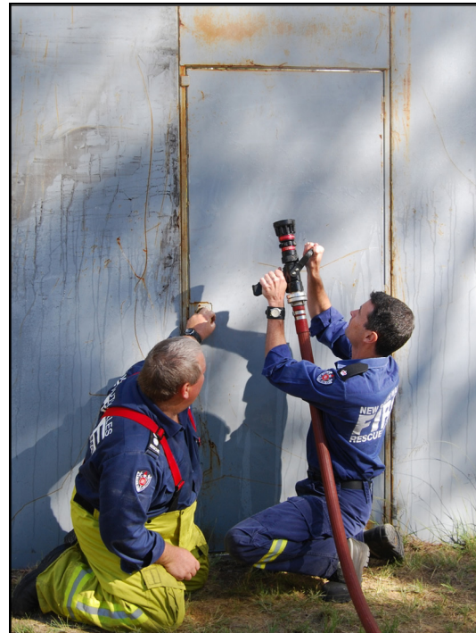
Figure 4. Door Entry Drill

Some firefighters and fire officers subscribe to the belief that use of acquired structures with realistic fuel loading is the only way to develop the necessary competence and skills to operate safely and effectively on the fireground. However, current standards such as National Fire Protection Association (NFPA) 1403 Standard on Live Fire Training (2007) place specific constraints on fuel types and loading. Some departments are faced with environmental constraints that preclude burning Class A fuel for structural live fire training and consequently use gas fired structures (or don’t conduct live fire training at all). Most departments who have access to purpose built structures and props for structural live fire training are limited to a single type of facility (due to economic constraints). This gives rise to an interesting set of questions: