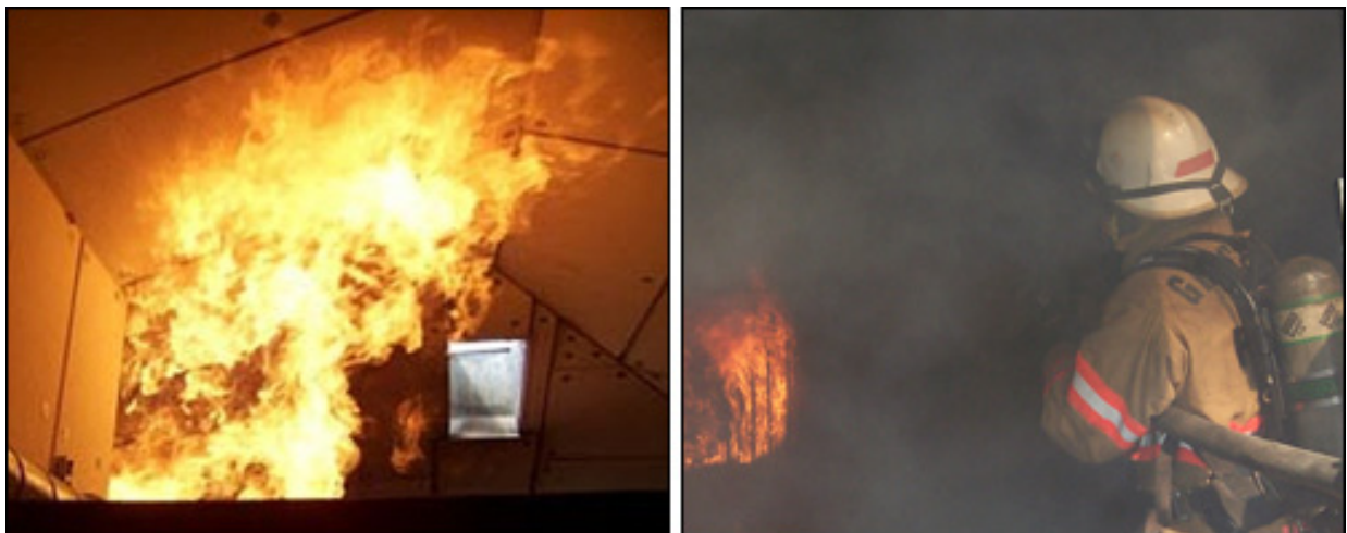
Figure 9. Live Fire Simulation with Class B/Gas (left) and Class A/Carbonaceous Fuel (right)

As illustrated in Figure 9, there can be obvious and substantial differences in physical fidelity when gas fired props are used to simulate a typical compartment fire. Depending on the purpose of the simulation these physical differences can be important. However, differences in functional fidelity may be even more important.