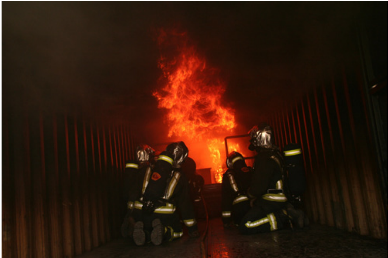
Figure 6. Participants Conducting a Fire Behavior Demonstration

Physical and functional fidelity are potentially quite important in developing firefighters' understanding of fire behavior and skill in application of fire control techniques. The two questions that Roy posed are important. However, two more fundamental questions could be asked: 1) To what extent is the fire behavior in this container based prop reflective of conditions that would be encountered in a "real" fire? 2) Does it matter (given the learning outcomes intended for this training session)?