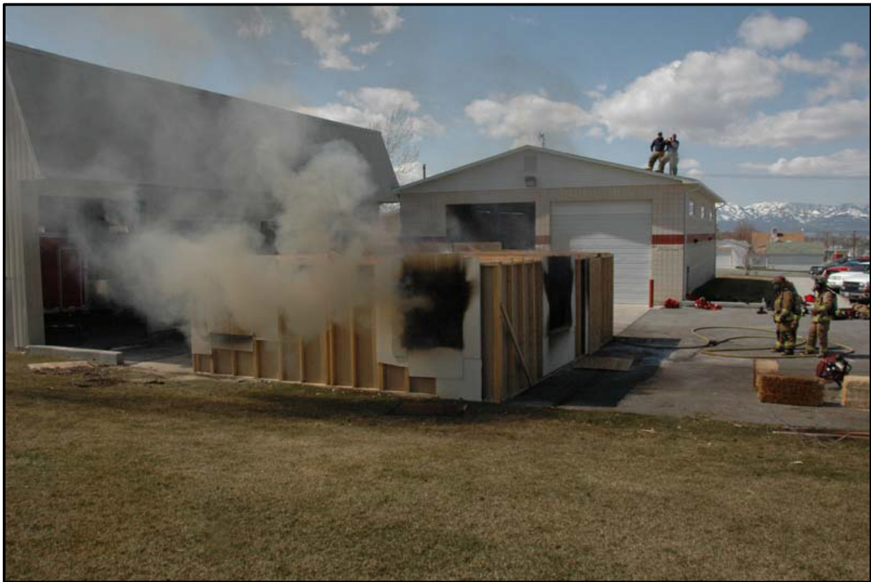
Figure 10. Build and Burn Single Family Dwelling