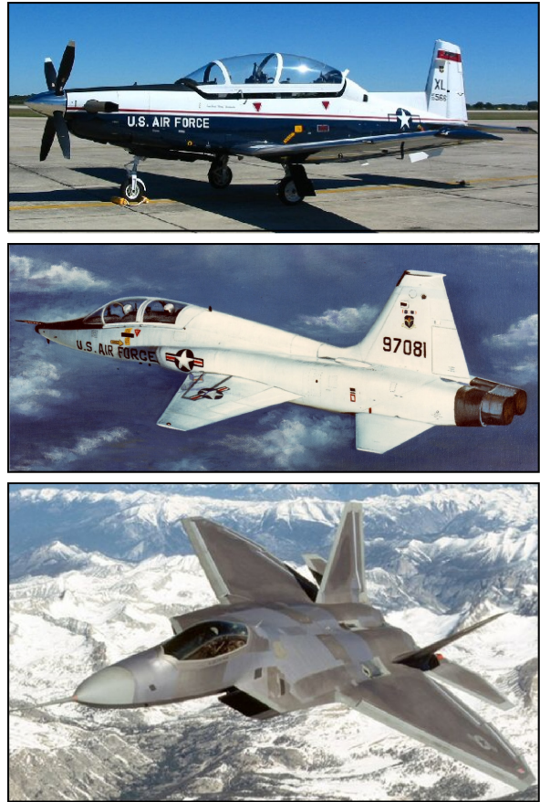
Figure 11. T6, T38, & F22 Aircraft

Container based props and burn buildings may be simple or complex dependent on their intended purpose and learning outcomes that they are designed to support (see Figures 12-16).